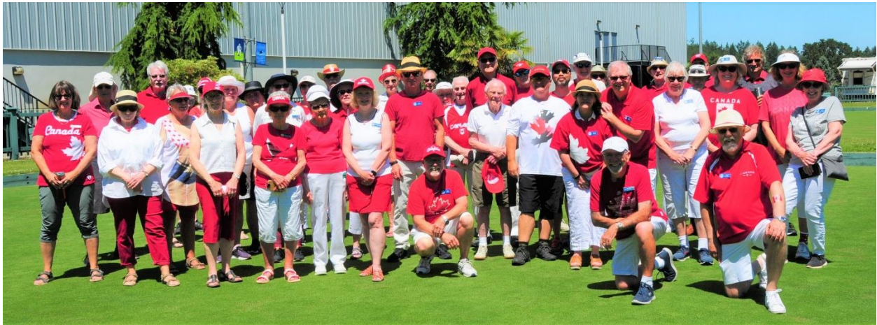
45 members gathered at the Greens to celebrate our Nation's birth all dressed in Red & White.